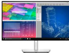
Dell UltraSharp 27 Monitor - U2722D

Create phenomenal 4K HDR content on the world's first professional monitor with 2K mini-LED direct backlit dimming zones.*