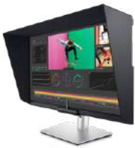
Dell UltraSharp 32 HDR PremierColor Monitor - UP3221Q

Create phenomenal 4K HDR content on the world's first professional monitor with 2K mini-LED direct backlit dimming zones.*