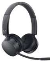
Dell Pro Wireless Headset - WL5022

Multi-task seamlessly across 3 devices with this premium full-size keyboard and sculpted mouse combo featuring programmable shortcuts and 36 months battery life.