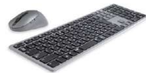
Dell Premier Multi-Device Wireless Keyboard and Mouse - KM7321W

Elevate your productivity on this innovative 27-inch QHD Hub monitor with a wide color coverage including DCI-P3. Features ComfortView Plus an always-on built-in low blue light screen, USB-C with up to 90W power delivery, and RJ45 connectivity.