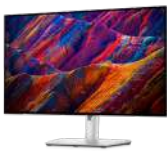
Dell UltraSharp 27 4K USB-C Hub Monitor | U2723QE

Designed, tested and certified to work seamlessly together with Dell systems. We offer full productivity and collaboration solutions as well as mounting kits and Rack Shelf for the data center.