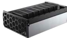
Hypershelf for Precision 3280

Elevate your video conferencing experience on this powerful, intelligent 4K webcam that optimizes your visuals with a large 4K Sony STARVIS™ CMOS sensor and AI Auto-Framing.