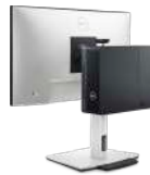
Precision All-in-One Display and Stand | CFS25

Be your most productive on a 27 inch monitor with brilliant color and contrast that features the industry's first IPS Black technology and a connectivity hub. 1