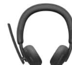
Dell Wireless Headset | WL3024

Create an unequalled 3D navigation experience with the most ergonomically designed product 3Dconnexion has ever created.