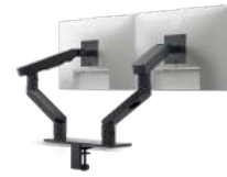
Dell Dual Monitor Arm | MDA20

Mount your Precision on the All-in-One Display and Stand to save space.