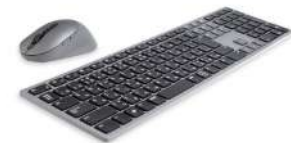
Dell Premier Multi-Device Wireless Keyboard and Mouse - KM7321W

Elevate your productivity on this innovative 27-inch QHD Hub monitor with a wide color coverage including DCI-P3. Features ComfortView Plus an always-on built-in low blue light screen, USB-C with up to 90W power delivery, and RJ45 connectivity.