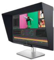
Dell UltraSharp 32 HDR PremierColor Monitor - UP3221Q

Create phenomenal 4K HDR content on the world's first professional monitor with 2K mini-LED direct backlit dimming zones.*