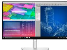
Dell UltraSharp 27 Monitor - U2722D

Create phenomenal 4K HDR content on the world's first professional monitor with 2K mini-LED direct backlit dimming zones.*